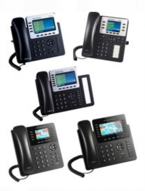
Basic Phone Operation